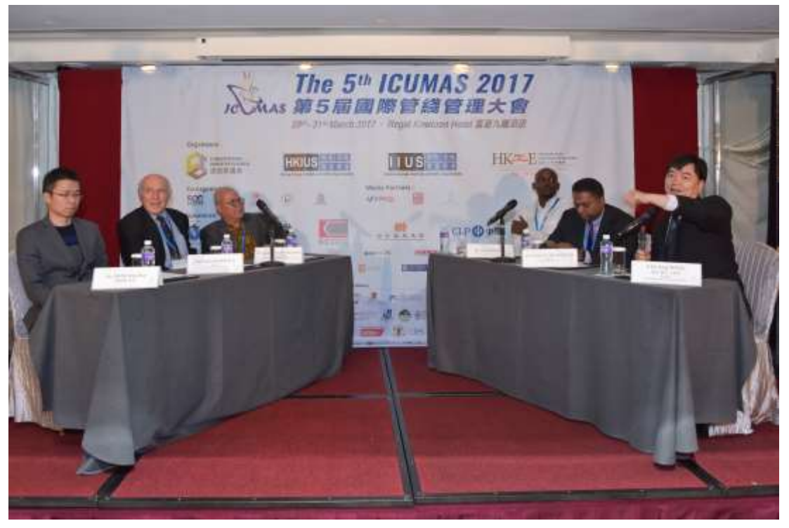
"Utility Professionals Summit" - Panel members from different countries

"Utility Survey Methods and How Accurate Surveys Can Help in Project Safety and Progress?"