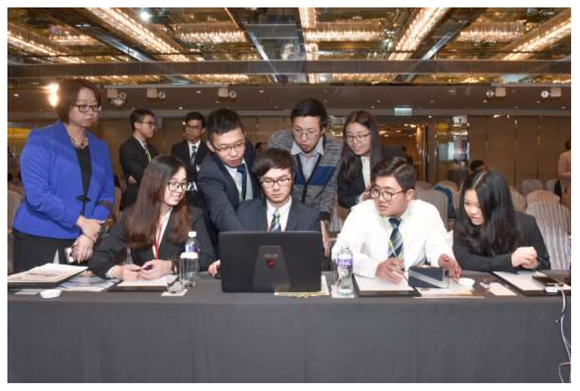
Student Helpers and staff were setting up Facebook live for the "UTILITY PROFESSIONALS SUMMIT"