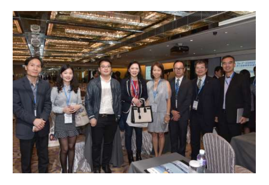
BIM Session Speakers and guests exchanged during coffee break time