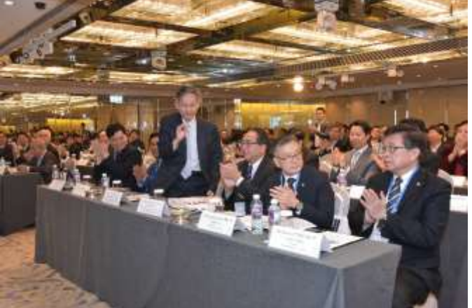
Welcoming of honorable and major guests of ICUMAS 2017