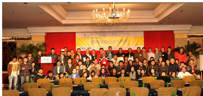
Group photo of speakers and participants.