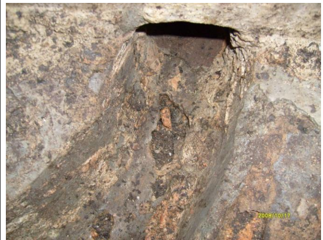
Fig. 4 Other condition: Invert was found broken. 圖四. 其他狀況: 行水破裂