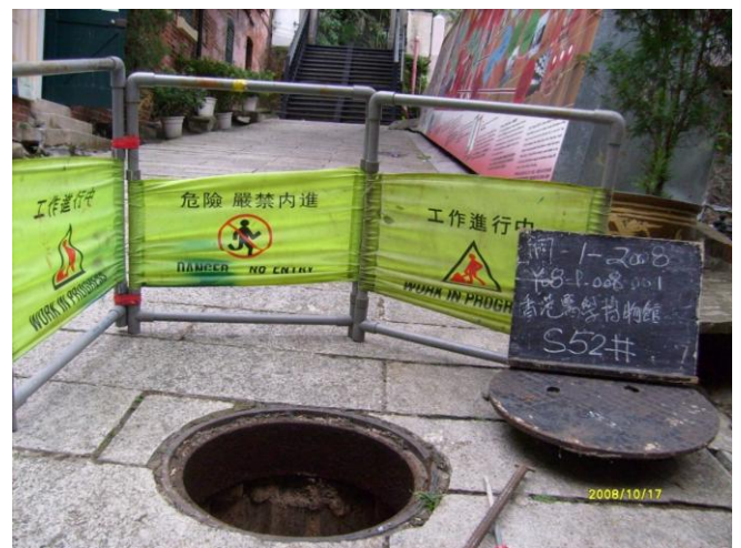
Fig. 2 Manhole location photo 圖二. 沙井位置相片