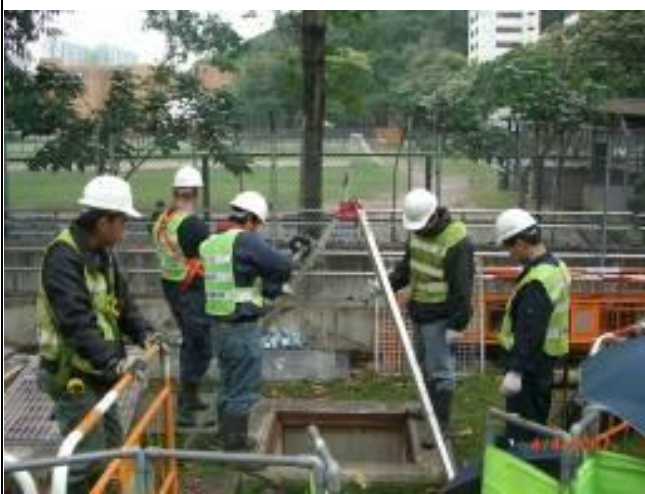
Fig. 1 Open a manhole 圖一. 開沙井