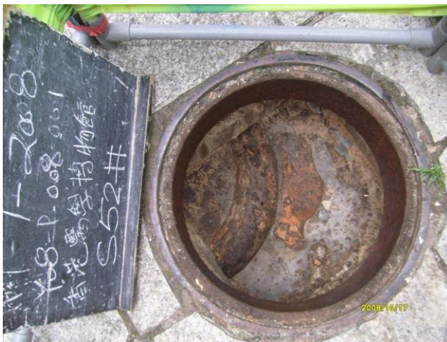
Fig.3 Manhole internal photo 圖三. 沙井內部相片